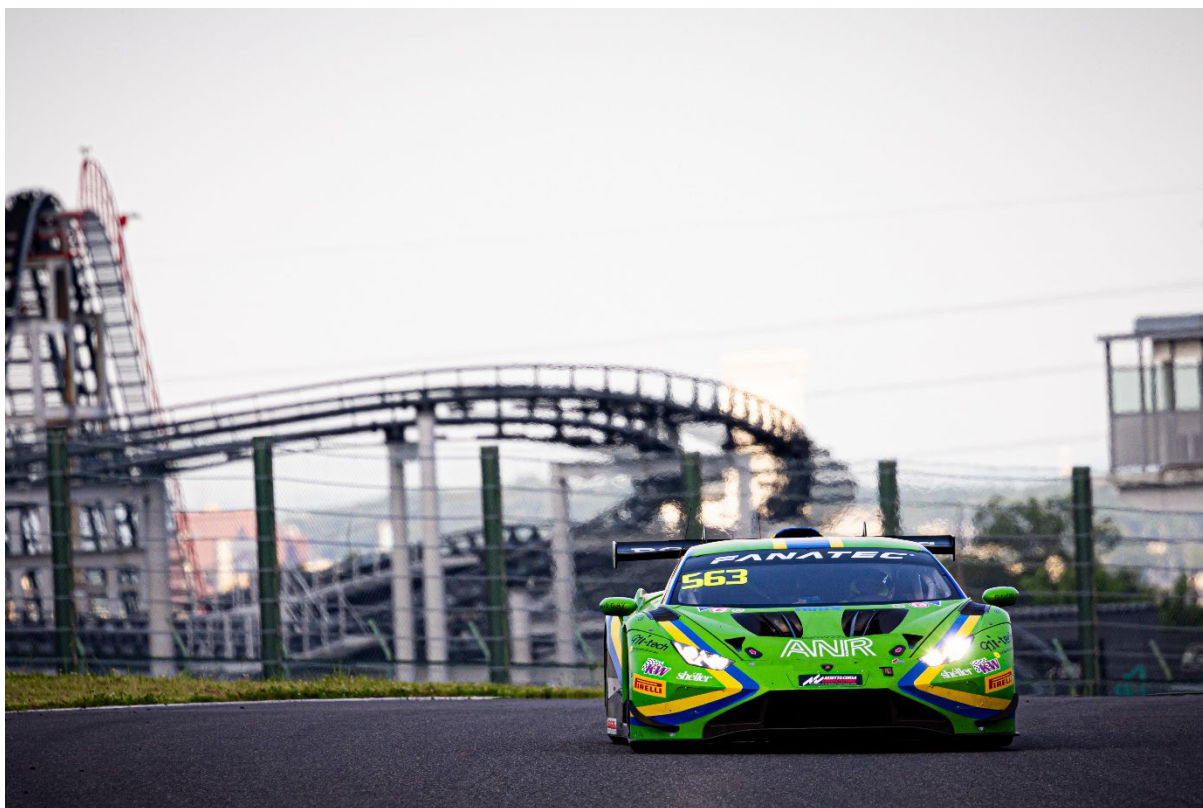
#563 – Mizutani / Nemoto

The GT World Challenge Asia Championship continues next month with a double-header at Okayama.