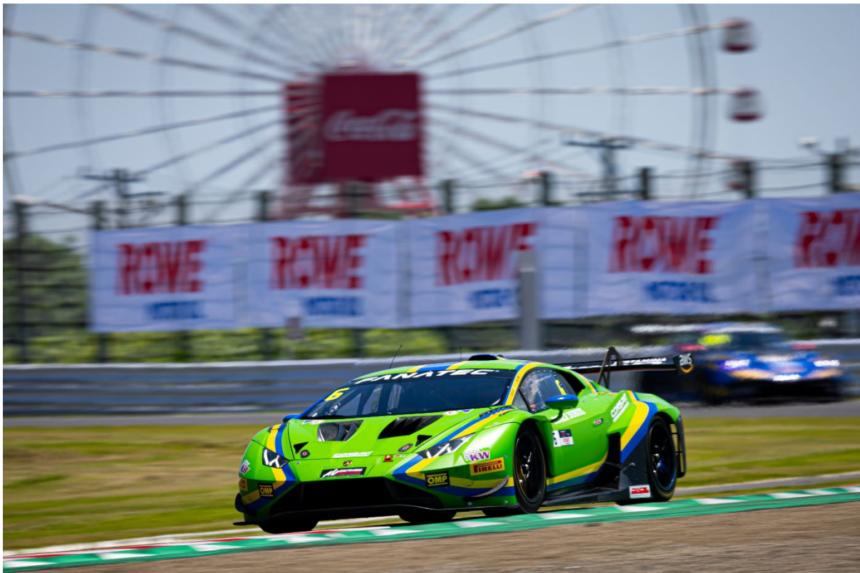
6 – Bian / Liberati

Thursday afternoon's test was marred by mixed weather but all the practice sessions on Friday were conducted in hot, dry conditions. Qualifying for race one saw the Am drivers set the grid. Bian lined up on row seven, sixth in class with Uchida alongside him, fourth in Silver-Am. Mizutani was eighth quickest in Silver-Am.